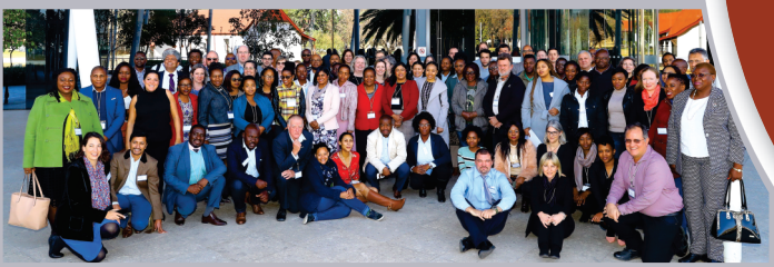
Intensive co-development process with range of stakeholders over 3 years