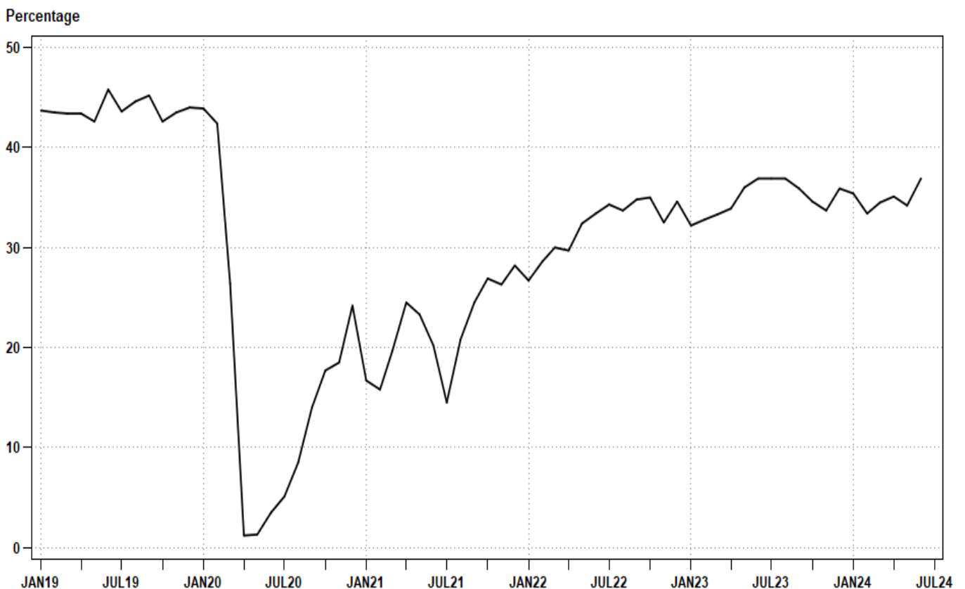
Figure 1 – Seasonally adjusted occupancy rate for the accommodation industry