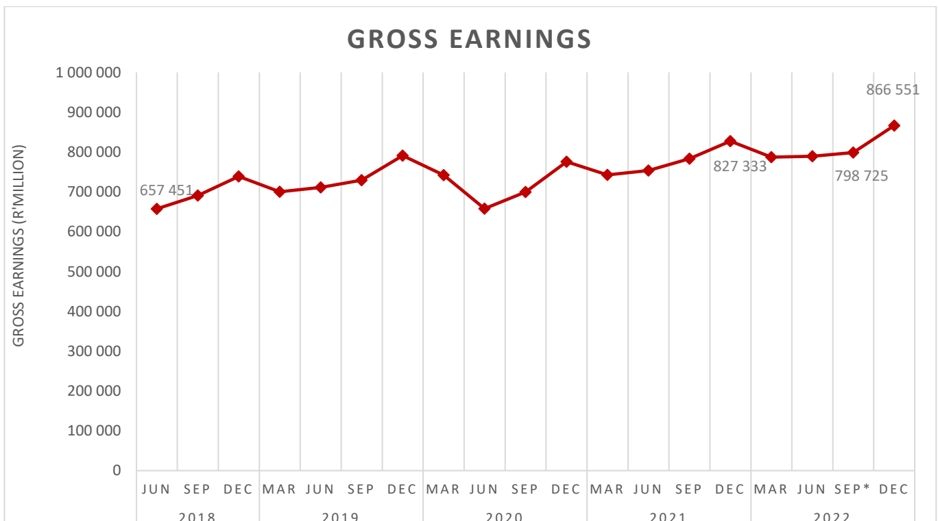
Figure B--: Gross earnings of employees in the formal non-agricultural sector, June 2018 – December 2022

Part-time employment decreased by 85 000 or -7,2% year-on-year between December 2021 and December 2022.