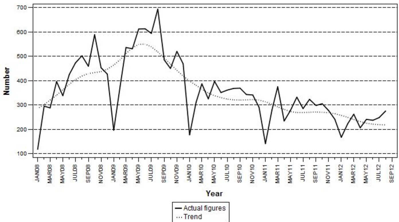
Figure 2 – Number of insolvencies

The number of insolvencies decreased by 17,2% in the first eight months of 2012 compared with the same period of 2011. A year-on-year decrease of 14,9% was estimated in August 2012.