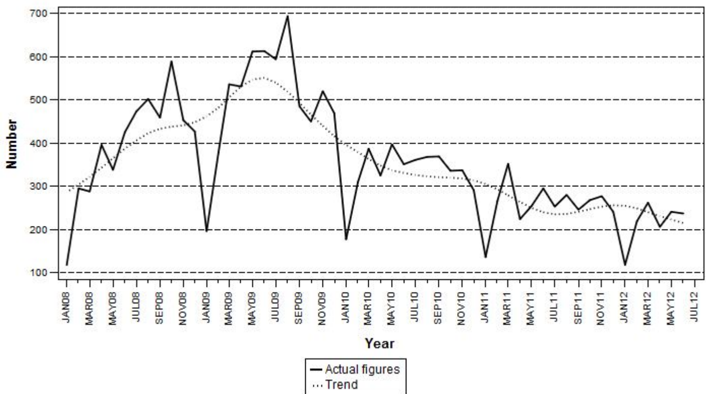
Figure 2 – Number of insolvencies

The number of insolvencies for the first six months of 2012 decreased by 16,0% compared with the same period of 2011. There was an 11,5% decrease in the number of insolvencies in the second quarter of 2012 compared with the second quarter of 2011. A year-on-year decrease of 19,7% was estimated for June 2012.