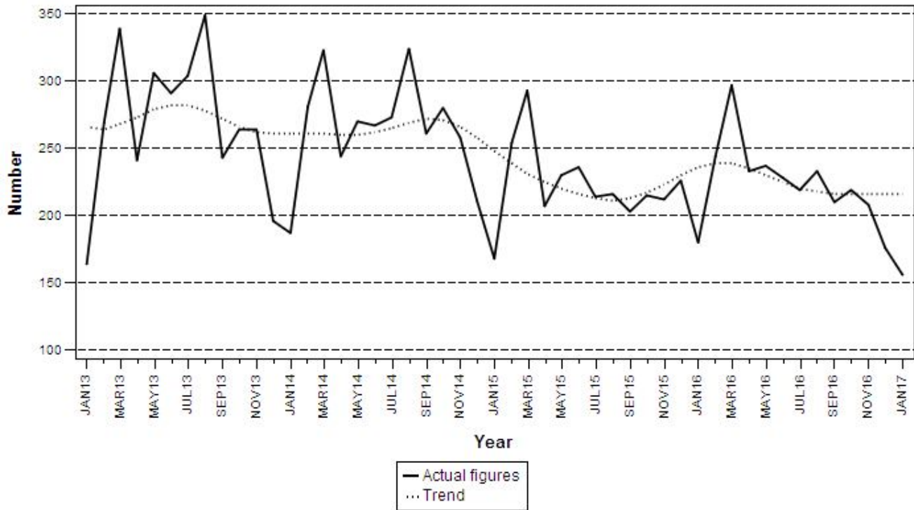
Figure 2 – Number of insolvencies

The estimated number of insolvencies decreased by 13,3% year-on-year in January 2017. A 12,6% decrease was estimated in the three months ended January 2017 compared with the three months ended January 2016.