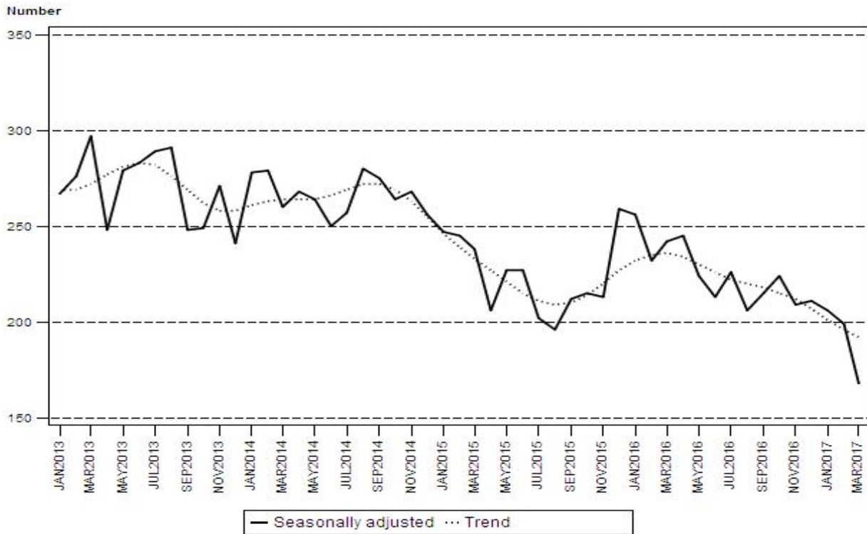
Figure 2 – Number of insolvencies

Seasonally adjusted insolvencies decreased by 15,6% in March 2017 compared with February 2017. This followed month-on-month changes of -3,4% in February 2017 and -2,4% in January 2017 – see Table 6.